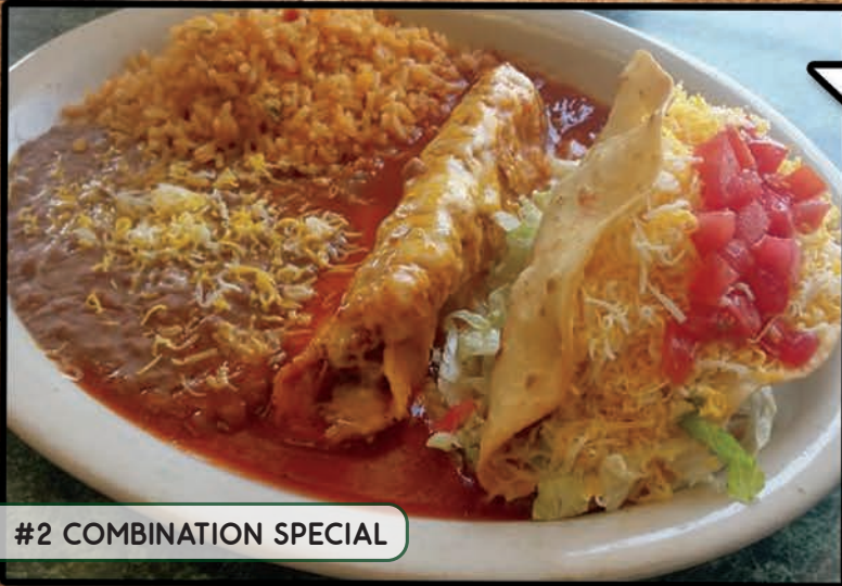
#2 COMBINATION SPECIAL