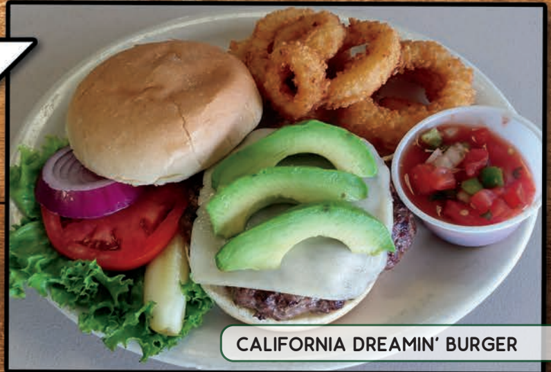
CALIFORNIA DREAMIN' BURGER

ALL SELECTIONS ARE SERVED WITH PICKLES, GARNISH AND CHOICE OF SALAD, CHILI, WAFFLE FRIES, SWEET POTATO FRIES OR ONION RINGS.