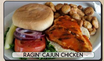
RAGIN' CAJUN CHICKEN