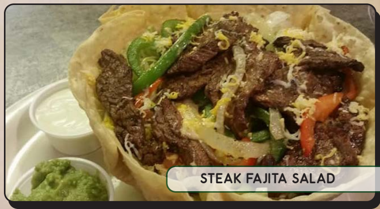
STEAK FAJITA SALAD

House Chipotle Ranch - Ranch - Bleu Cheese - Italian - Dorothy Lynch - Thousand Island - Salsa