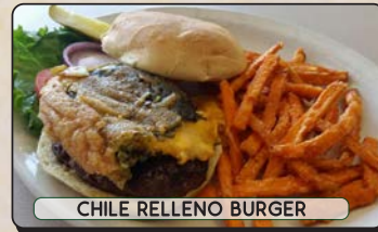
CHILE RELLENO BURGER

Sliced sirloin marinated and grilled with peppers and onions. Served in a hoagie with melted Monterey Jack on top. Philly goes south of the border!