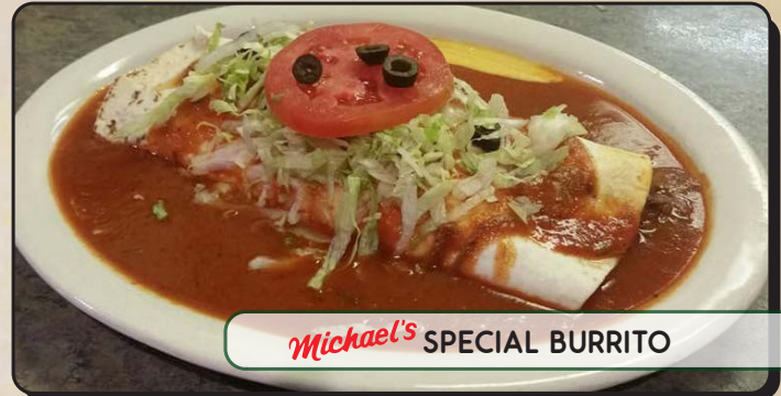
Michael's SPECIAL BURRITO

All are served with onions, peppers, lettuce, salsa, tortillas, cheese, jalapenos, rice and beans. Sour cream and guacamole available upon request!