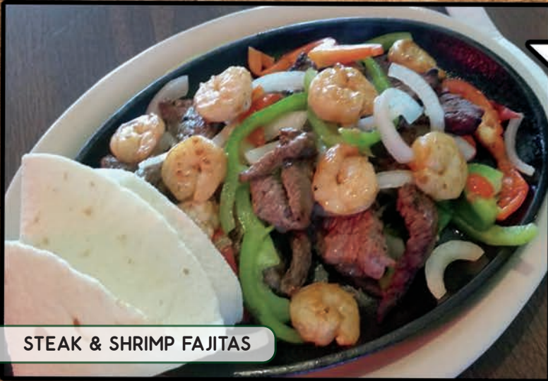
STEAK & SHRIMP FAJITAS