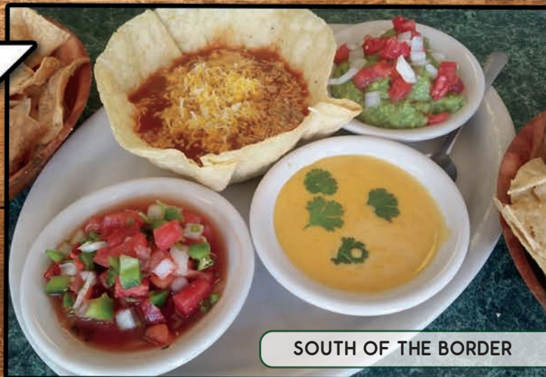
SOUTH OF THE BORDER

WE ALWAYS RECOMMEND OUR FAMOUS BEAN DIP & CHIPS FOR YOUR ENJOYMENT, BUT WE HAVE ADDED SOME GREAT NEW TASTES AND CHOICES.